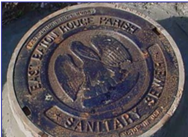
One of the first steps in rehabilitation includes a physical inspection of manholes and pipes to identify blockages.

Rehabilitation of the sewer collection system is a comprehensive physical process that begins with cleaning and inspection of sewer pipes and manholes. Typical rehabilitation repairs include pipe and manhole replacement and trenchless technologies that minimize above ground disturbances, such as cured-in-place pipe liners.